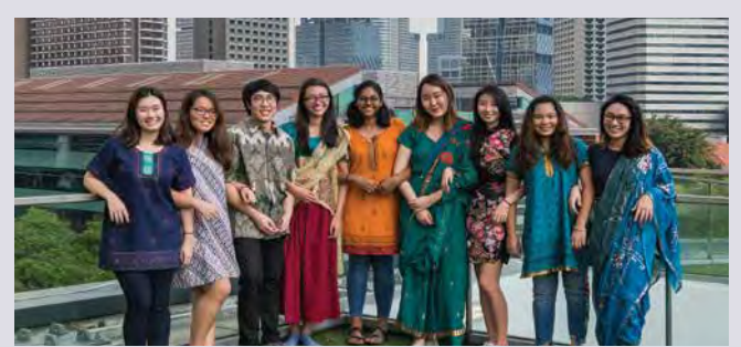
International Relations Club